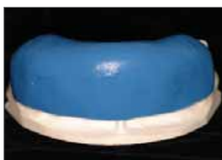
Make a silicon matrix.