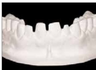
Uniform 1.0 mm reduction.