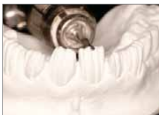
Make 1.0 mm depth cuts.