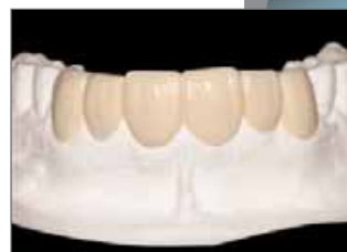
Wax to full contour.