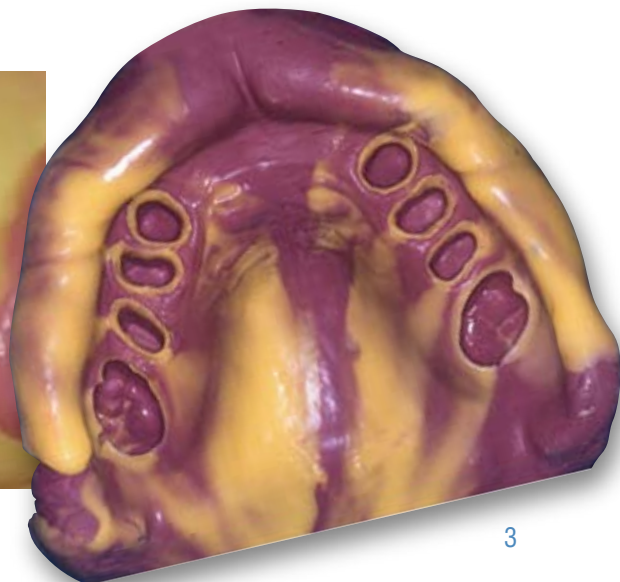
3M™ ESPE™ Imprint™ 3 VPS Impression Materials.